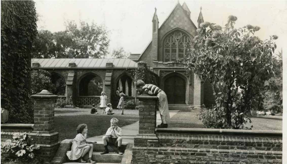
*The Troy Orphan Asylum's original compound on Spring Avenue in Troy, NY